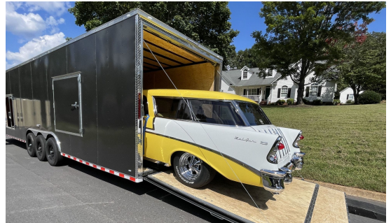
The Nomad being loaded into enclosed trailer and being transported to California