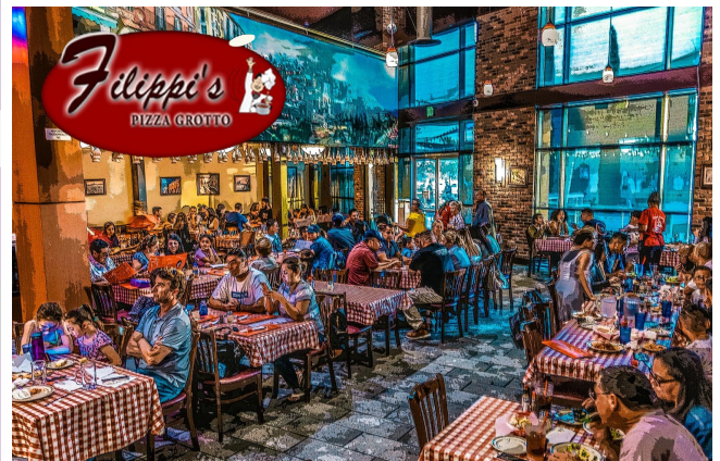
Filippi's Pizza Grotto - Santee 10767 Woodside Ave.