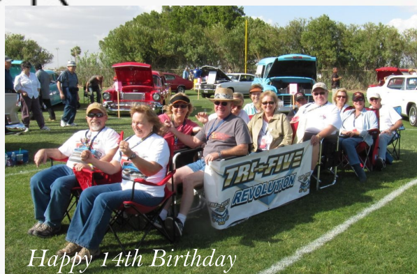
Happy 14th Birthday Tri-Five Revolution - 9/20